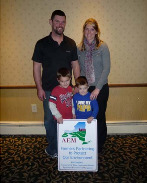
AEM AWARD Co-Vista Holsteins LLC Arcade, NY