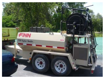
2010 Finn T-90 Hydroseeder

Financial assistance was provided through the New York State Department of Environmental Conservation to FL-LOWPA to purchase new hydroseeding equipment, complete streambank stabilization projects, and to implement agricultural best management practices.