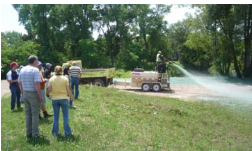
Hydroseeding demonstration in Attica, NY during the Water Quality Tour