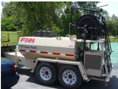
2010 Finn T-90 Hydroseeder

Financial assistance was provided through the New York State Department of Environmental Conservation to FL-LOWPA to purchase new hydroseeding equipment, complete streambank stabilization projects, and to implement agricultural best management practices.