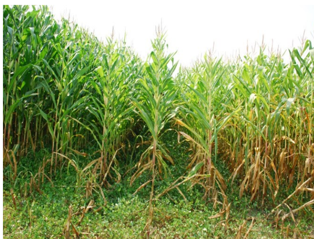
Interseeded Cover Crops