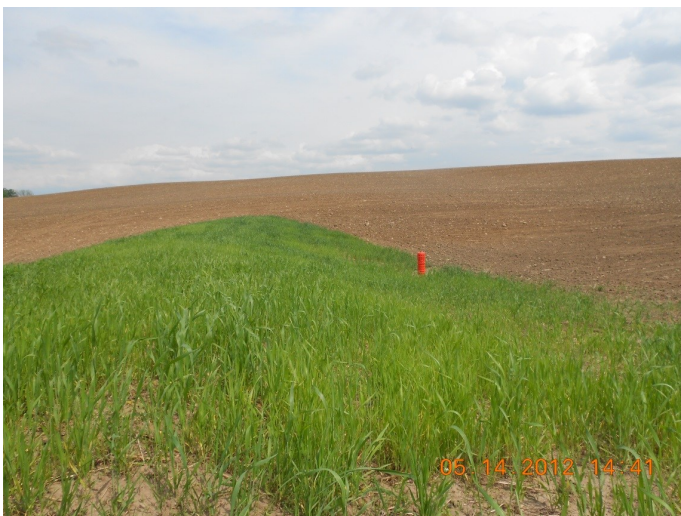
WASCOB, Monroe County