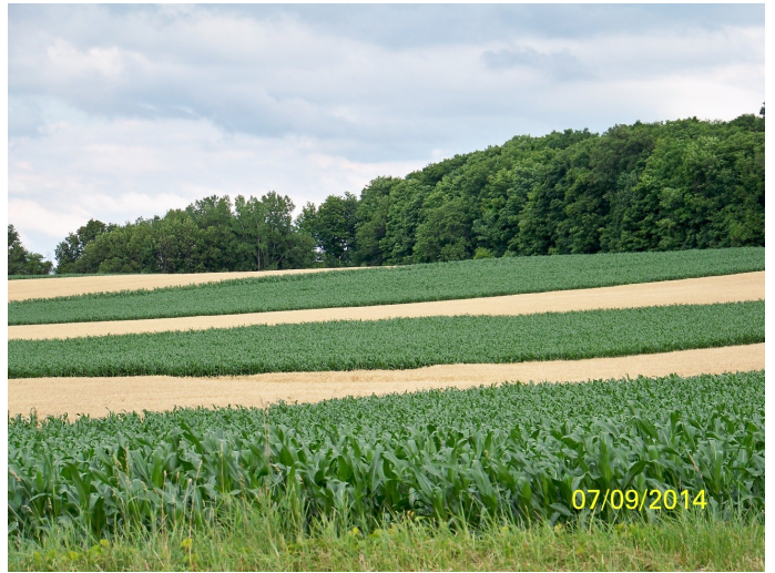
Stripcropping, Genesee County