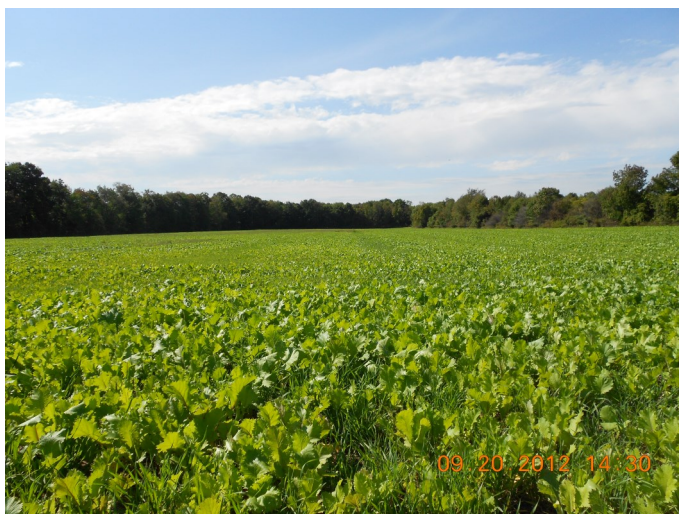
Radish and Wheat Cover Crops, Monroe County