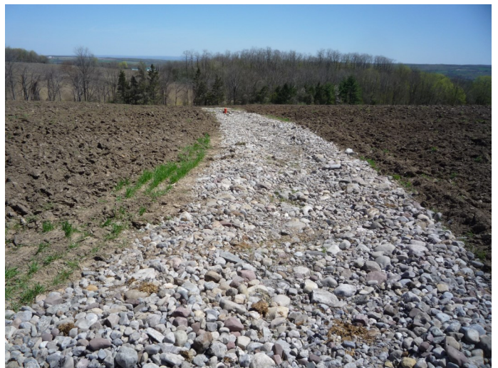
Lined Waterway, Wyoming County