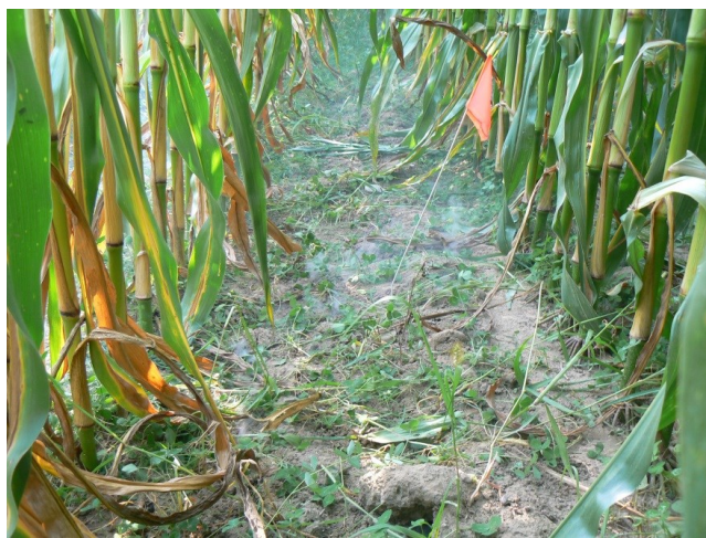
Frank Gibb's Smoke Machine (shows the importance of soil biota to soil structure)