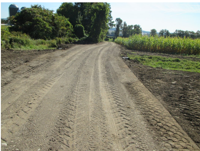
Animal Walkway, Genesee County