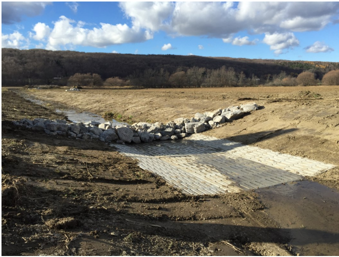
Grade Control Structure, Wyoming County