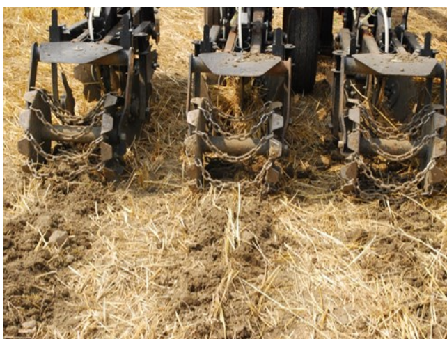
Reduced Tillage Equipment Demonstrations