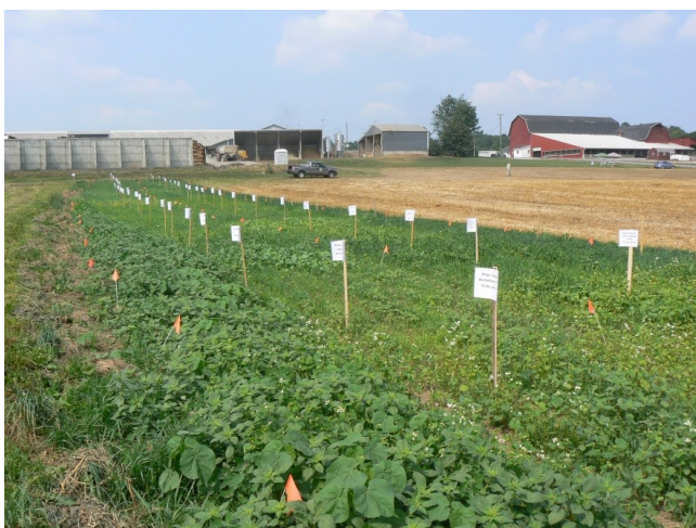
Cover Crop Seed Mixture Demonstration Plots

Over 130 farmers, consultants, and educators from across the region attended. The Field Day focused on live demonstrations of soil health techniques and featured key note speakers Ray Archuleta and Frank Gibbs. Some of the highlights are below!