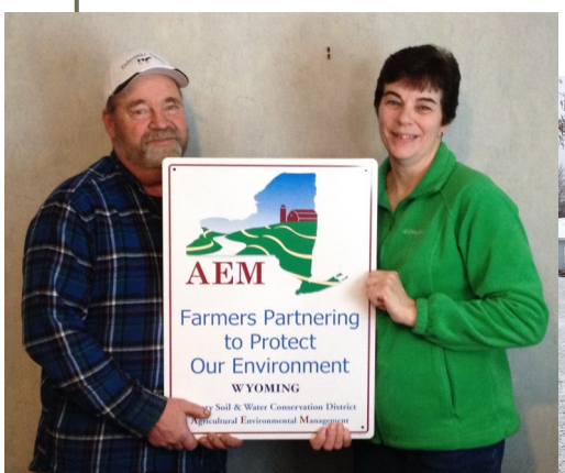
Zielenieski Farms, Inc