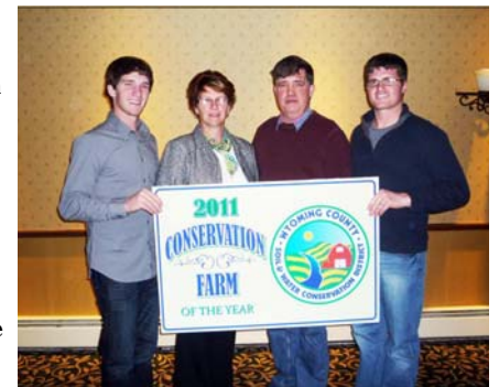
Right Picture: 2011 Conserva- tion Farm of the Year, Bliss Cattle Co., Bliss NY

Visit www.wcsxcd.org for a full listing of District programs and services