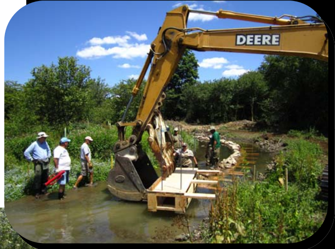
North Branch Trout Habitat Revitalization Project

The inaugural Ronald P. Herman, Sr. Partners in Conservation Award was presented to the Western New York Chapter of Trout Unlimited for outstanding achievement in the protection and restoration of trout streams in Wyoming County. For over 40 years, Trout Unlimited has worked closely with the District, NYSDEC Bureau of Fisheries, U.S. Fish & Wildlife Service and many other groups, organizations and municipalities to maintain and enhance the fisheries resources in the Wiscoy, East Koy, Cattaraugus and Oatka Creeks in Wyoming County and throughout Western New York.