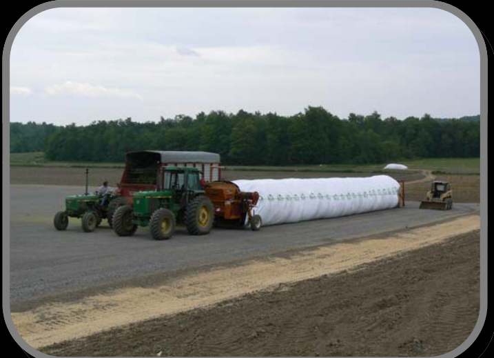
Top Left: Livestock stream crossing under construction at Seewaldt Bros, Top Right: Completed access road culvert at Seewaldt Bros. Bottom Left: Ag Bag storage area at Richard Pilc Farm - before, Bottom Right: Ag Bag Storage at Pilc Farm after Construction.