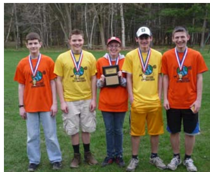
Left Picture: 2011 Envirothon Winners, Perry High School