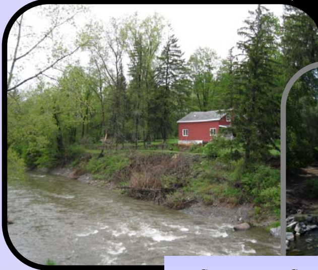
Cattaraugus Creek Streambank Stabilization in the Town of Arcade

Wyoming County SWCD provides technical assistance on soil, water, and related natural resources to municipalities, farmers, and landowners who utilize the information to make sustainable land use decisions and protect water resources. The Wyoming County SWCD works with many stakeholders to secure cost share funding which is used to complete Best Management Practices on farms, water quality improvement projects, and stream channel restoration.