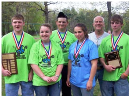
2009 Trailside Envirothon Wyoming County First Place Team